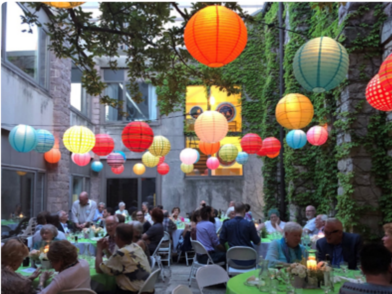
Festooned and decorated, the courtyard was the perfect setting for dinner on a lovely summer evening.