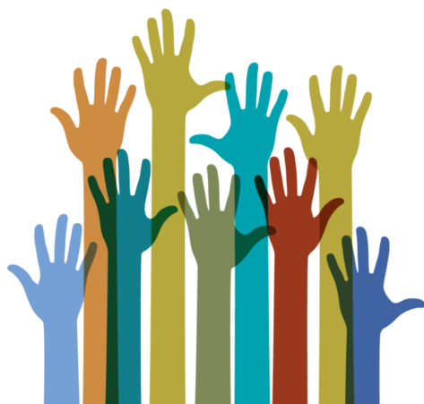
Immigration + Social Justice

Did you know that since July 2017, an estimated 5,400 children have been separated from their parents at the southern United States border? (NBC News Report, October 25, 2019). During the time period July 1, 2017 through July 1, 2018, 207 of those children separated were younger than 5 years old. (Id.). Many of those separated were sent to one of 121 facilities in 17 different states. (Family Separation by the Numbers, ACLU.org).