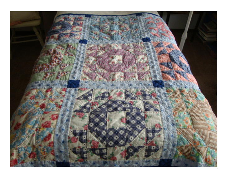
The Project HOPE quit, pictured above. The quilt pattern, known as "Single Wedding Ring," dates from the late 19th century.